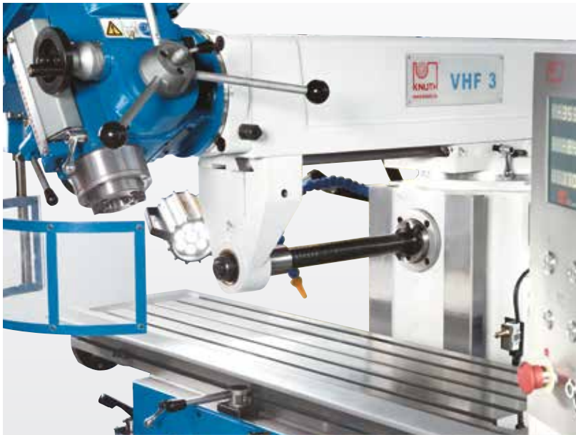
Horizontal milling spindle with outer arbor support for long milling arbors