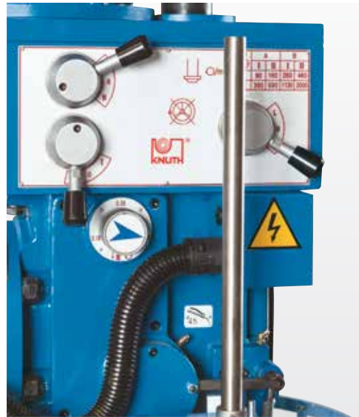
Automatic 3-step quill feed