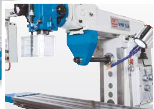
Long milling arbors are guided via a solid outer arbor