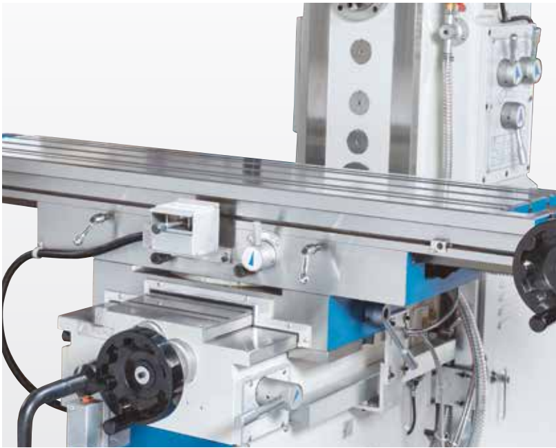
The milling table features a large setup area and can be rotated in linear direction