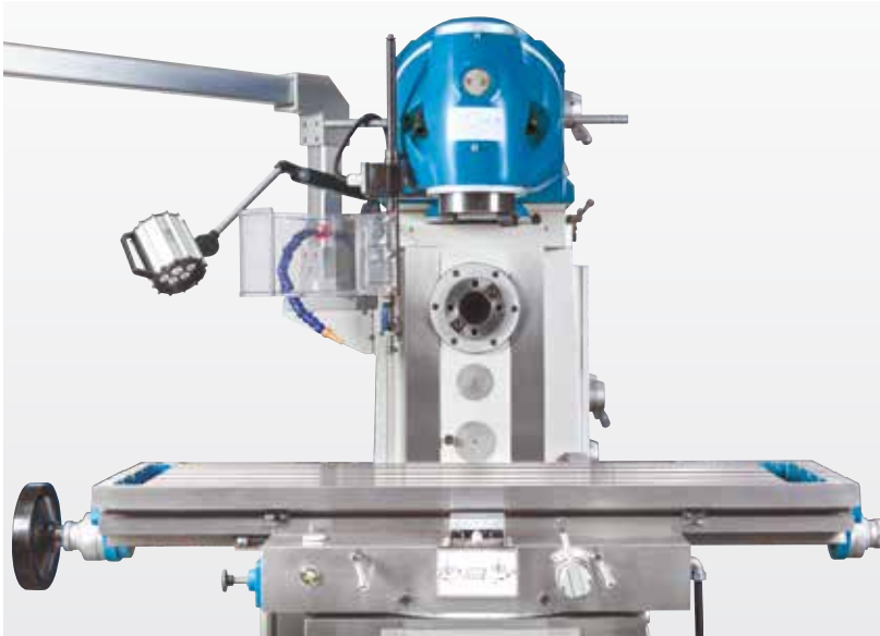
Powerful horizontal spindle with its own drive