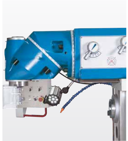
Universal cutter head, swivels on 2 planes