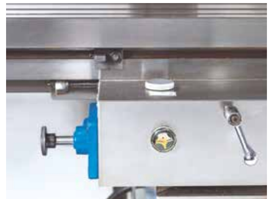
Integrated manual central lubrication