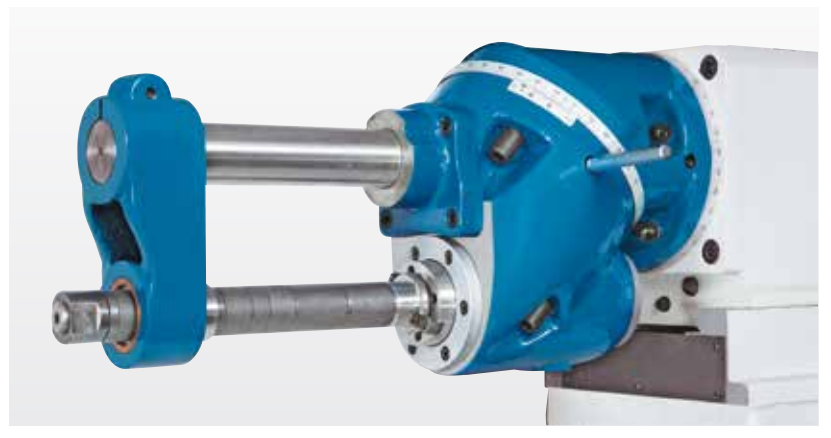
Horizontal cutter (standard equipment)