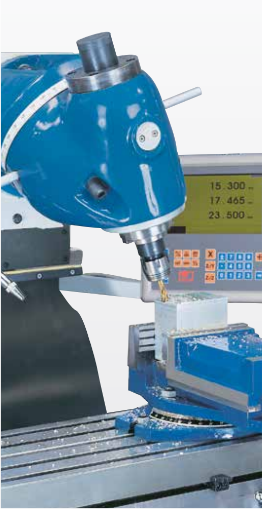
Cutter head swivels on 2 levels