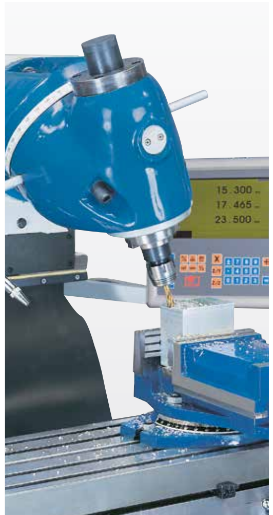
Cutter head swivels on 2 levels