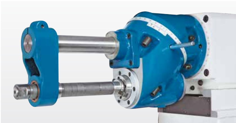
Horizontal cutter (standard equipment)