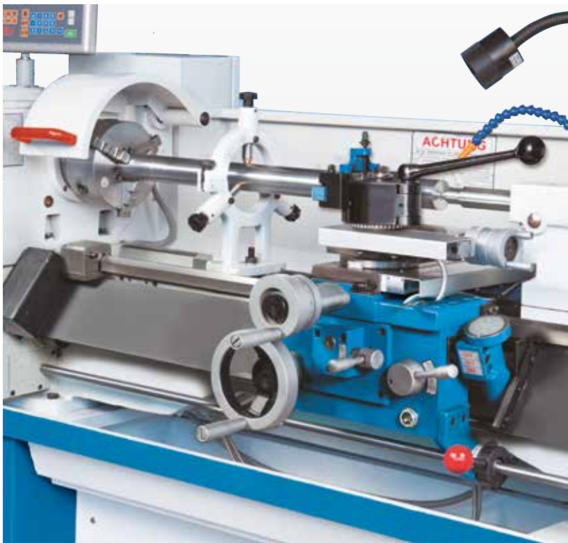
Long workpieces are supported in rigid rests