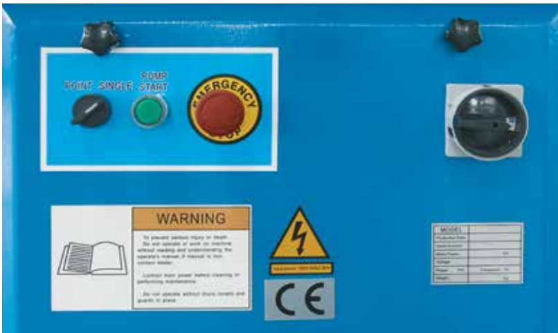
The machine provides a user-friendly design and reliable functionality