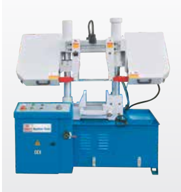
HB 280 T is shown