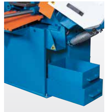
Easily accessible cooling tank with large chip protection screen