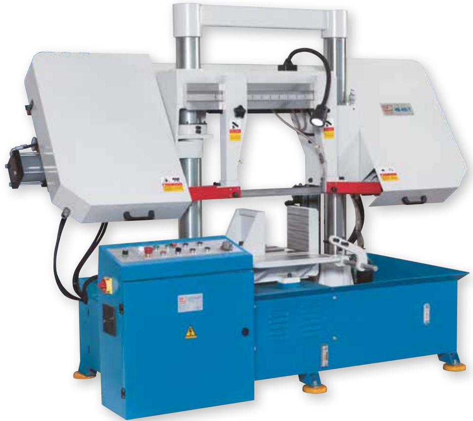
HB 400 T is shown