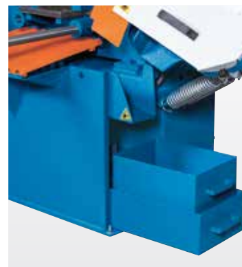
Easily accessible cooling tank with large chip protection screen