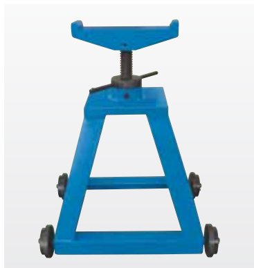
Material support base, only for HB 280 T

High-performance workshop band saw with hydraulic machine vise