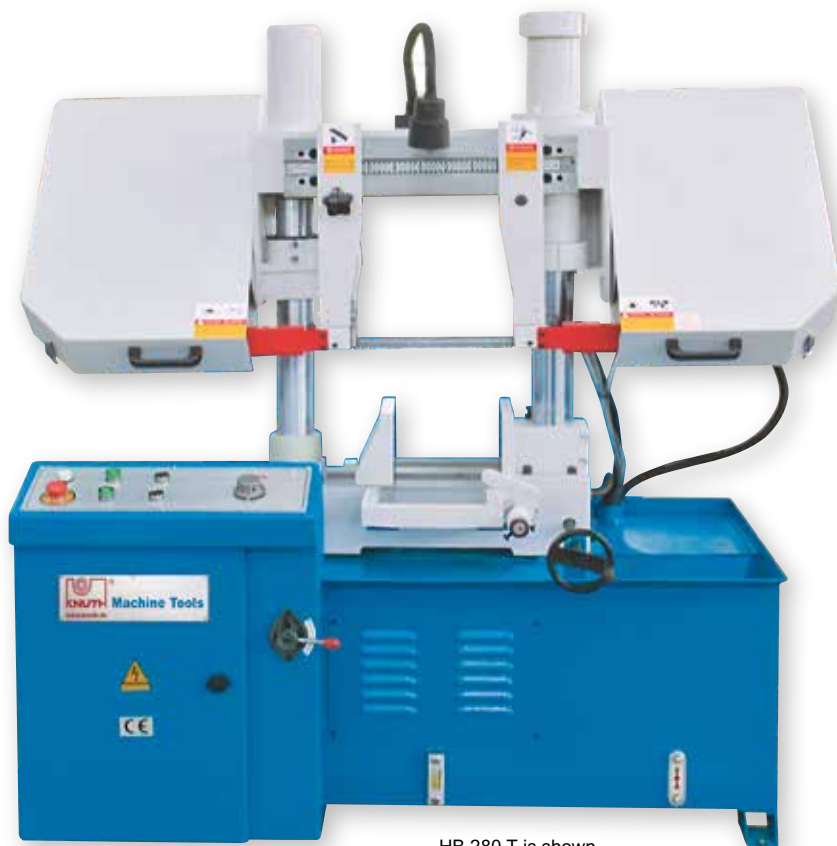
HB 280 T is shown

• Hydraulic workpiece clamping, • Dual-column construction