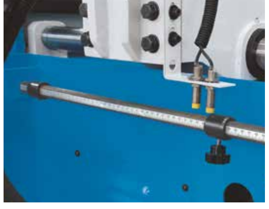
Automatic workpiece feed and traversing vise with manually adjustable stroke limit stop