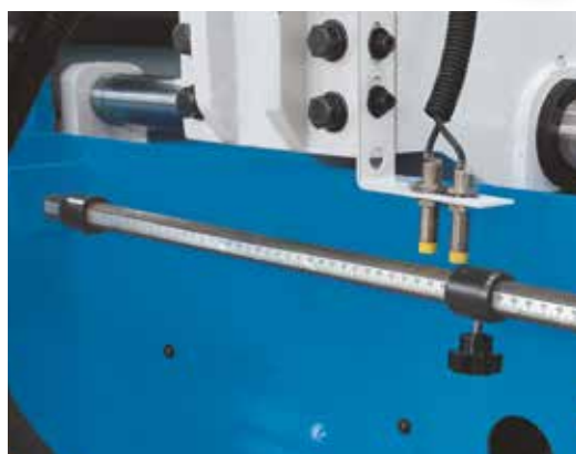
Automatic workpiece feed and traversing vise with manually adjustable stroke limit stop