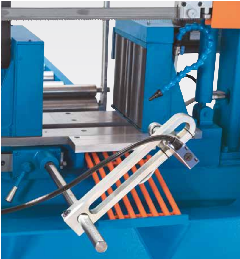
Driven feedrate rolls stop automatically when the material