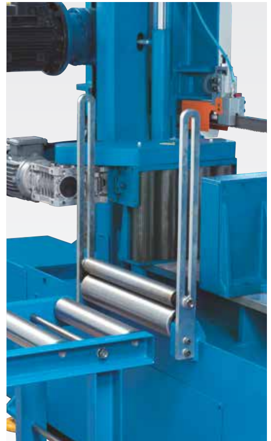
Solid feed roller table and material guide for workpiece bundles