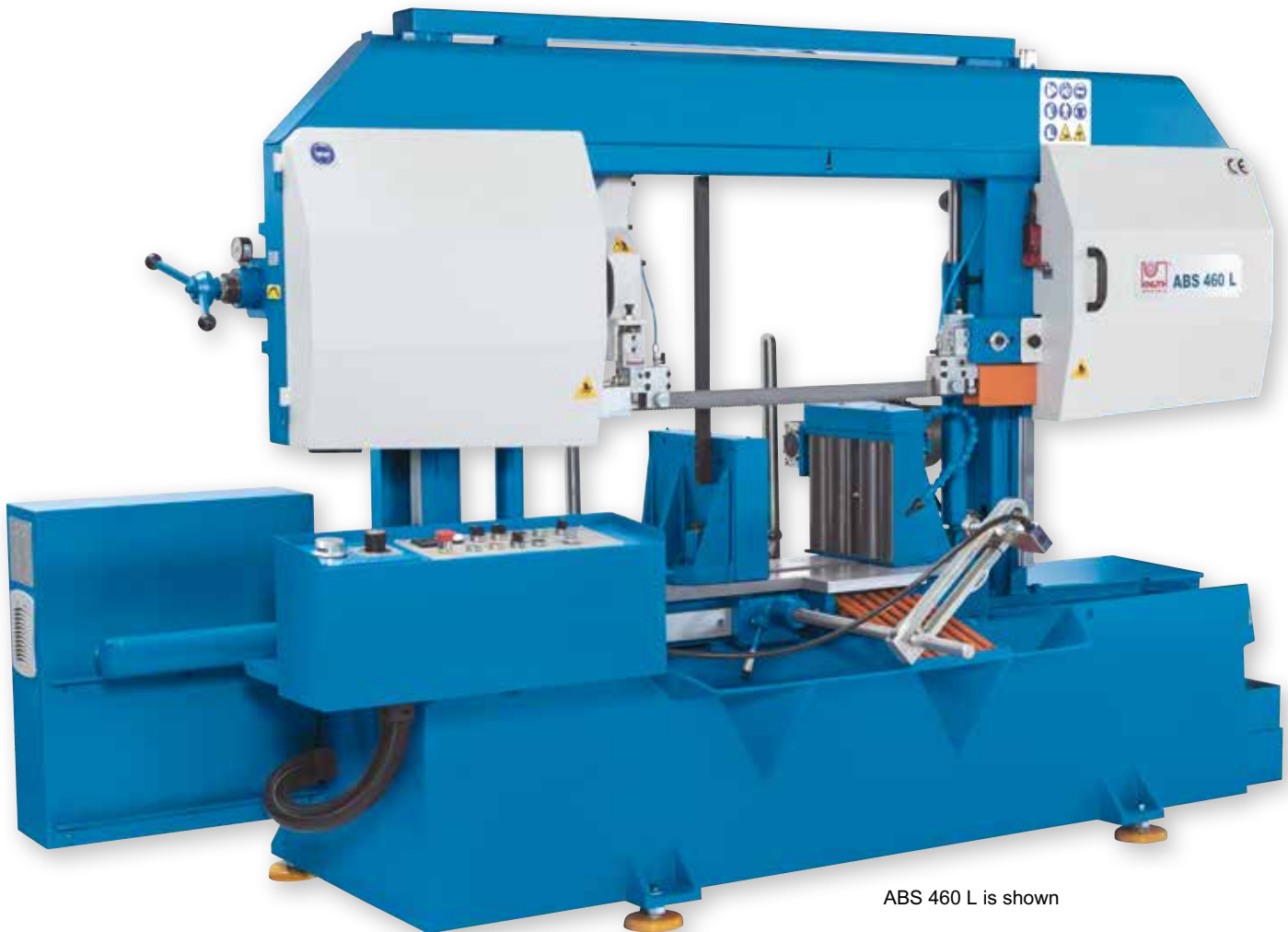
ABS 460 L is shown