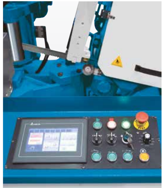
The touchscreen allows for easy and convenient programming for fully automated operation