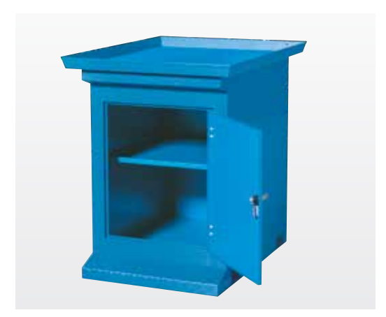
Universal machine base with storage room for the KB 20 S / KB 20 SV (Part No. 123952)

for this machine, visit our website and search for KB 20 S or KB 32 SF (Product Search)