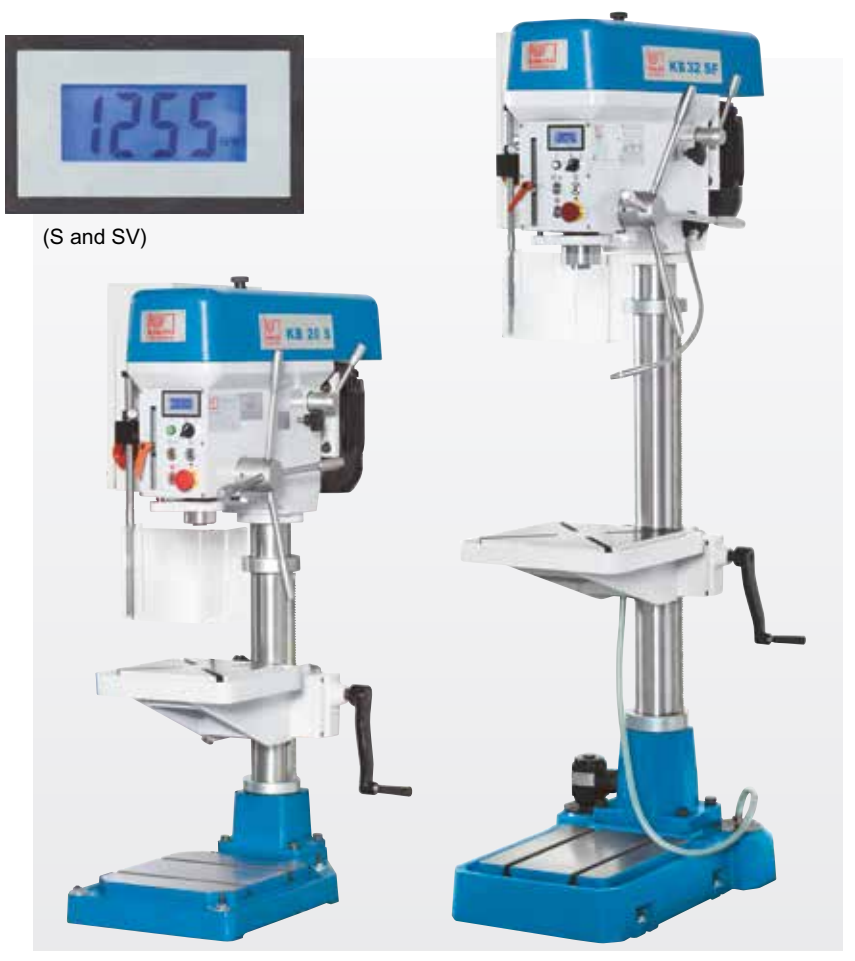
KB 20 S is shown