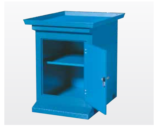
Universal machine base with storage room for the KB 20 S / KB 20 SV (Part No. 123952)

for this machine, visit our website and search for KB 20 S or KB 32 SF (Product Search)