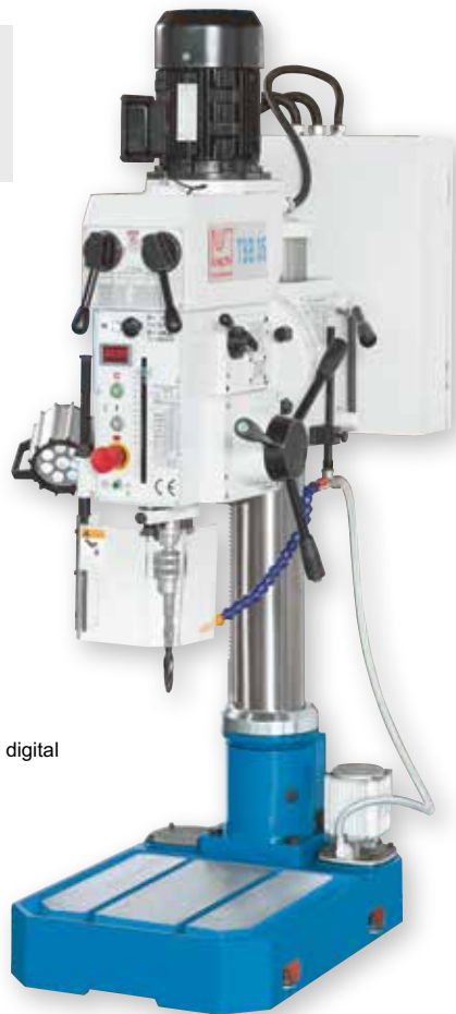
TSB 35 is shown with digital rpm display