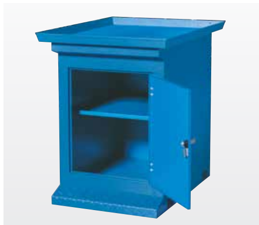
Universal machine base with storage room Part No. 123952