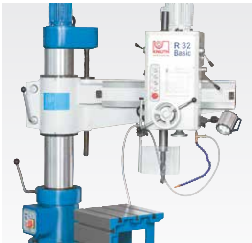
Swiveling boom for large throat widths