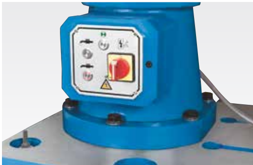
Rigid column base with central main switch