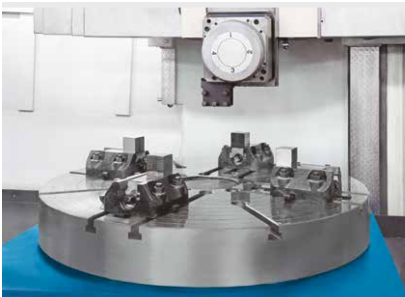
Face plate with 4-station tool changer